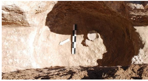
"Inside the Bronze Age" – Archaeology