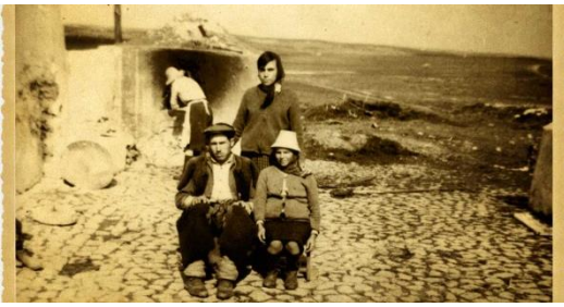
"Alentejo Time" - Intangible Heritage